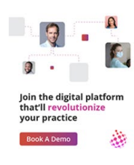
Visit the Endodontic SuperSystems Booth