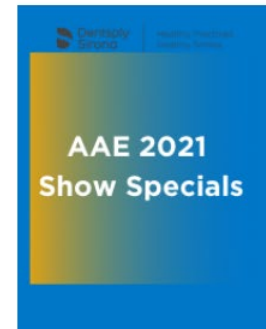
Visit the Dentsply Sirona Booth