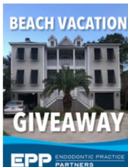
Visit the Endodontic Partners Booth