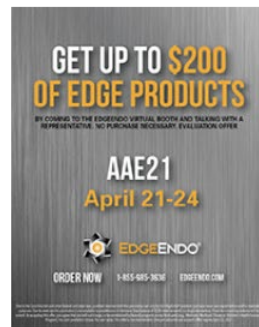
Visit the EdgeEndo Booth