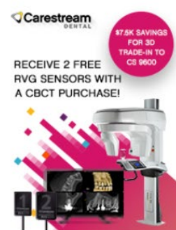
Visit the Carestream Booth