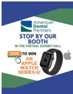
Visit the American Dental Partners Booth