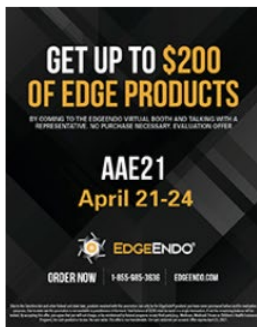
Visit the EdgeEndo Booth